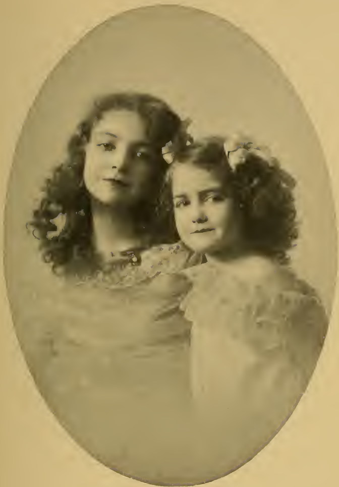
LILLIAN AND DOROTHY GISH